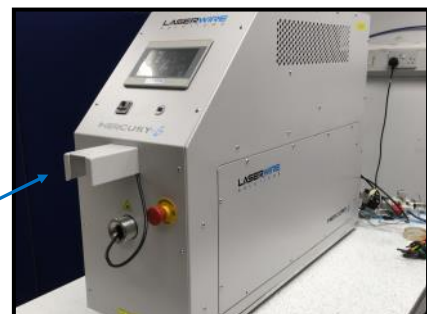
Optional barcode reader

A key factor in the design of the Mercury-6 has been the rotary stripping head with auto-focus optics adjusted to the outer layer of multi-layer cables, such as high voltage Coroplast.